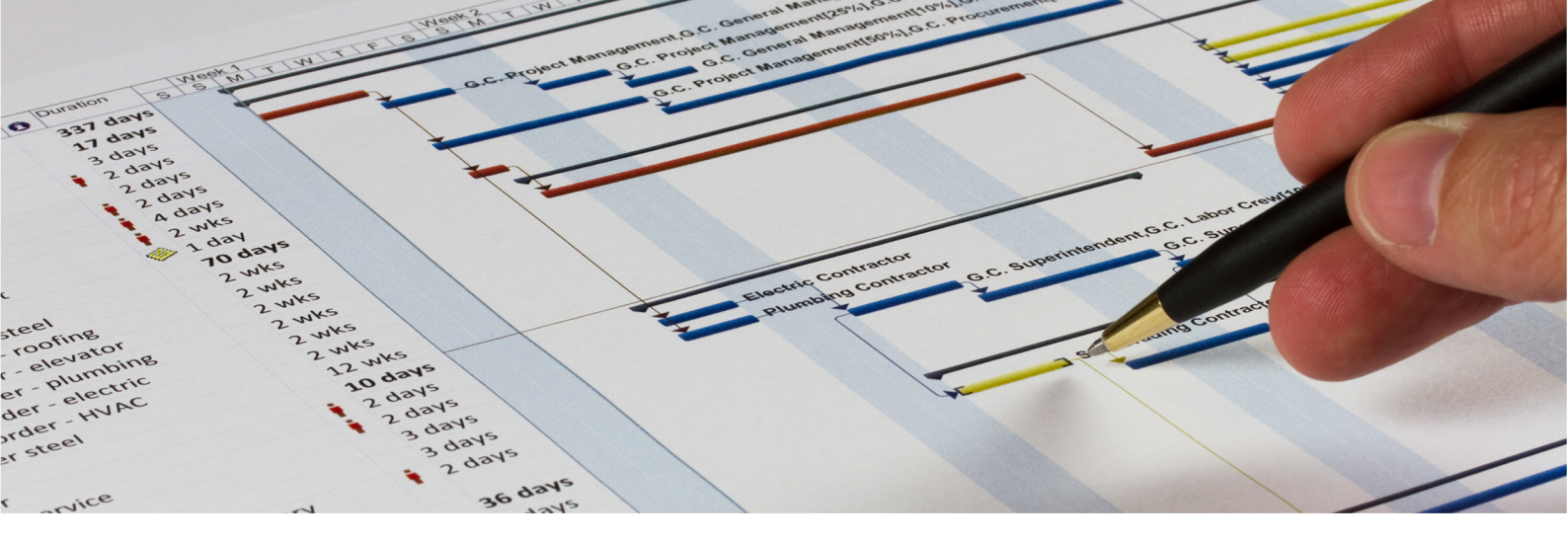
■ PROJECT MANAGEMENT SERVICES